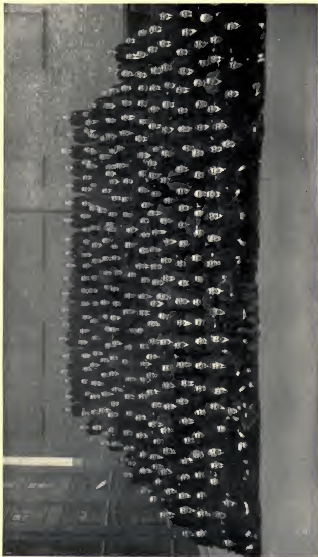
INMATES OF A MEN'S INDUSTRIAL HOME